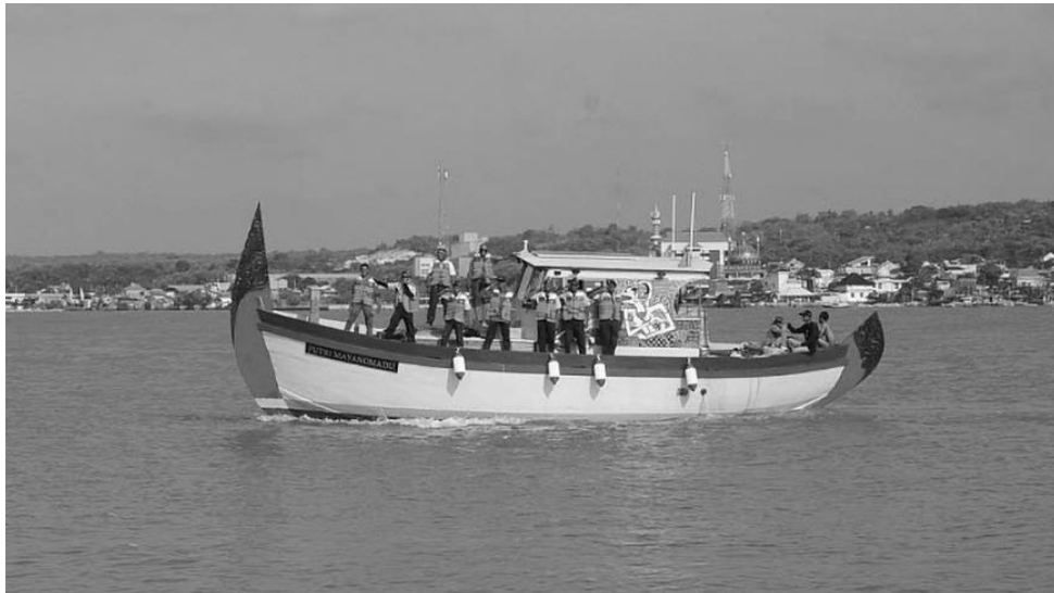
Figure 8: Sea Trial