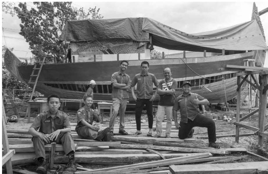
Figure 6: Completing the hull construction