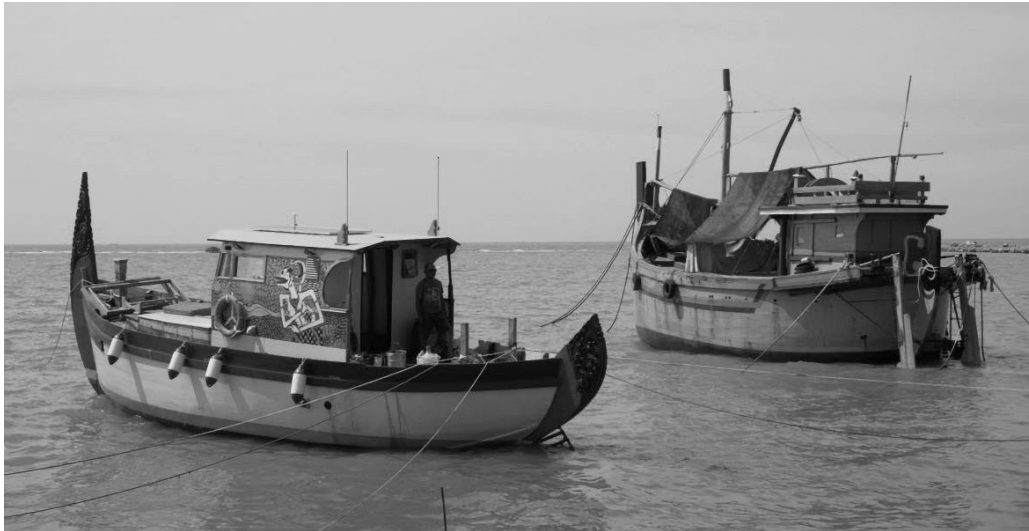
Figure 3: The Daughter of Mayangmadu is seen side by side with a traditionally built Javanese wooden fishing boat