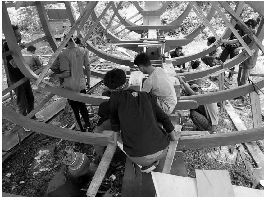
Figure 5: The students are working on setting the frames in the boatyard.