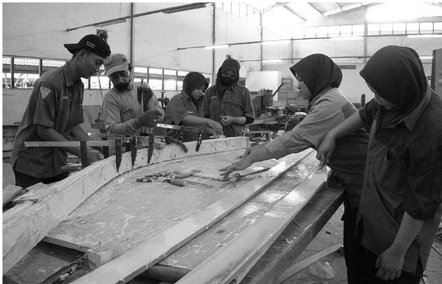
Figure 4: The students are constructing the boat's laminated frames in the school workshop

The boat was constructed in a traditional wooden boatyard in Kandangsemangkon Village, Paciran East, Java (Coordinates 6052'17.02"S - 112018'50.02"E) as a training project for a team of students from SMK Negeri 3 Buduran Sidoarjo – a state-owned Vocational High School – and students from SMK Sunan Drajat, Paciran – a local Islamic Vocational Boarding High School. The teamwork involved 45 male and female students, guided by 4 Master Boatbuilders as trainers. The training lasted for 8 months, with 6 months dedicated to fieldwork. Throughout the training period, the students stayed in provided housing next to the boatyard.