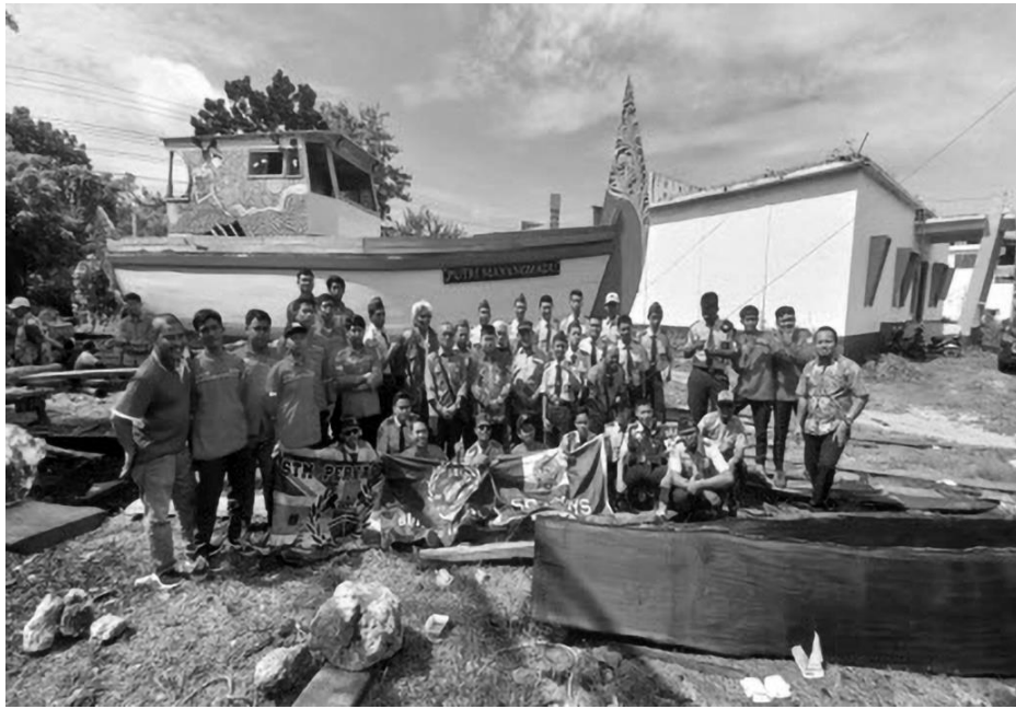
Figure 7: Pre-launching