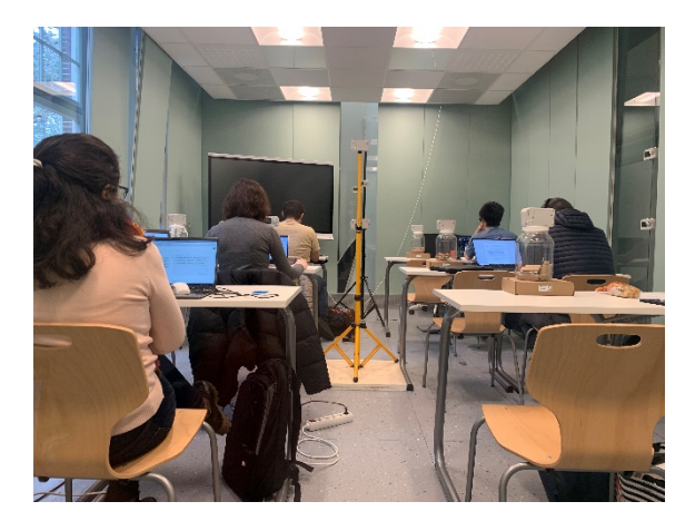
Fig. 1 – Experimental setting.

The full-scale experiment was conducted in the Experience room (6.5 (l) × 4.2 (b) × 2.6 (h)) of the SenseLab [26] (See Fig. 1). Six healthy subjects, including three males and three females, volunteered to participate in this experiment. They were asked to remove their masks after seated [27]. The average age of them was 27 \pm 2 years old. Prior to the study, all subjects gave informed consent to participate in the experiment, and they were able to leave the Experience room at any time in the case they were not feeling comfortable.