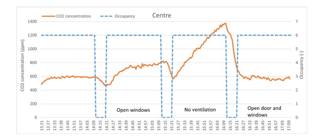
Fig. 3 - CO<sub>2</sub> variation over time at one location.

Additionally, it can be seen from the figure that the CO<sub>2</sub> concentration could reach to a relatively steady state at the end of all test periods, except for the third period- 'no ventilation'; the CO<sub>2</sub> concentration hardly reached a plateau. Nevertheless, the results collected during the last five minutes seemed closest to the steady-state concentration. Besides, results of the one-way ANOVA test showed that the average CO<sub>2</sub> concentration collected from all indoor locations did not vary significantly among the last ten measurements (i.e. last five minutes) of all the periods, which indicated the CO<sub>2</sub> concentration during the last five minutes of all test periods could be considered as stable. Therefore, the following analyses were all based on the results collected during the last five minutes of each test period.