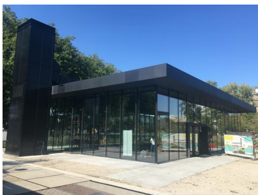
Fig. 2 – Co-Creation Center Building, located in the TUD Green Village, The Netherlands

The TUD “Technoledge Climate” module focuses on indoor comfort and associated physiological concepts. An important part of the teaching activities is traditionally dedicated to building surveys, where the students can collect spot measurements of comfort indicators, such as temperature, relative humidity, and illuminance. Due to the COVID-19 related restriction, the module was largely re-designed, and new innovative approaches were implemented so that students were able to engage with the experience of environmental surveys in existing buildings. Furthermore, existing content dedicated to daylight measurements and modelling required a substantial update which were implemented by staff participating in the project. Teaching concepts for visual comfort and advanced daylight modelling are essential for students to understand the importance of well-designed windows and shading systems. As complex technology advances in this field, students need to learn how to master the appropriate design tools to assess existing spaces accurately, using cutting-edge simulation methods delivered through appropriately scaffolded strategies.