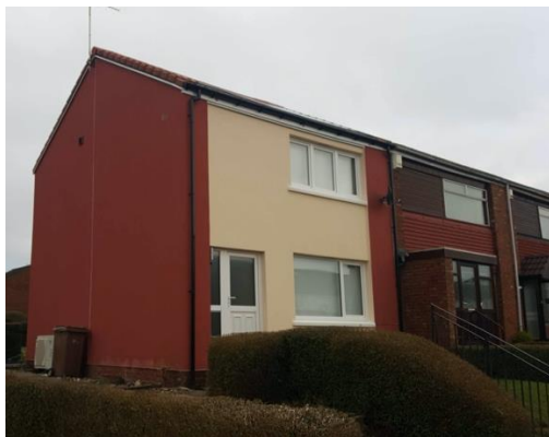
Fig. 4 – Test house, UoS; UK

Building on existing knowledge in relation to static energy balancing methods, students at UoS acquire the necessary knowledge to carry out dynamic building simulations and to assess uncertainties. For this purpose, students gain knowledge about what is important at key points in the design process, depending on what the user wants to know when undertaking a building simulation (environment, building, plant, user). They will learn appropriate modelling approaches for the mathematical description of the corresponding heat and mass transfer processes. This includes a deeper insight into individual simulation modules, which students develop on their own by means of didactically suitable programming tools. Students implement their theoretical knowledge by modelling and simulating a reference building and calibrating it with the monitored data set from the UoS.