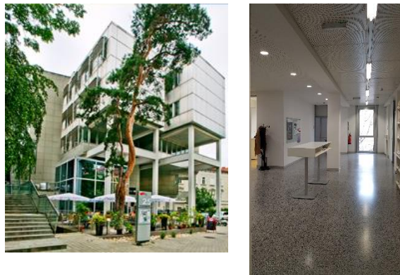
Fig. 3 – TUG- Institute for building physics, services and construction (outside left and inside institute right), Austria

tools and understand various statistical and visualisation methods that allow them to examine and exploit large data sets to support their research projects and findings (Tab. 2).